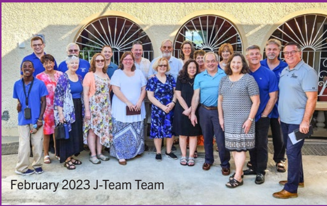
February 2023 J-Team Team