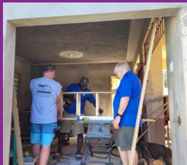
New workshop area

Thank you for your prayers for each team, for the process of getting the medications through customs, and for all the paperwork that needs to be processed for our medical personnel each trip.