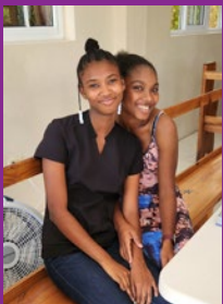
Ipream and Pinky

visit and bring devotions, and at TFA (TEAMS Faith Academy). Our builders built a home for Doc and Sally and their disabled son as well as had time to put our new workshop area to good use building seating for our back veranda.